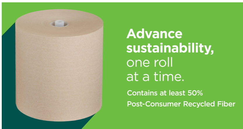
Pacific Blue Ultra® towels are made of recycled material

GP PRO strives to use resources efficiently, source responsibly, protect endangered areas, and support wildlife conservation and biodiversity. We are committed to helping maintain healthy forests. We make thoughtful choices about what we use to make our products. For instance, GP PRO's tissue, towel, and napkin products employ an extensive use of recycled fiber, culminating in over 500,000 tons of recovered paper saved from ending up in landfills in 2023. Also, we work with suppliers and NGOs to conserve and protect water, restore vulnerable wildlife habitats and ensure there are flourishing forests for future generations.