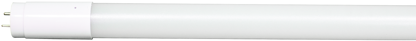
*Nano All Plastic Lens

The LED Magic Tube serves as a special energy efficient replacement for traditional fluorescent T8 lamps. Designed to operate on instant-start electronic ballasts.